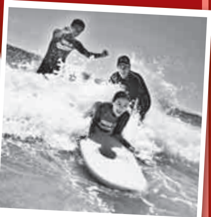
Gold Coast, Australia